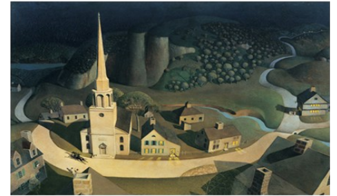
Midnight Ride of Paul Revere by Grant Wood

A three day workshop for teachers and school librarians