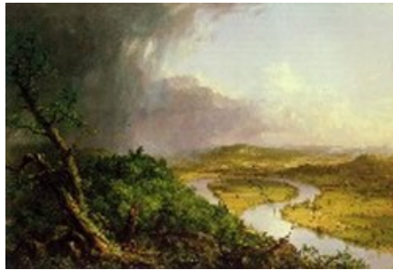
View from Mount Holyoke by Thomas Cole

It consists of a collection of 40 high quality reproductions of American masterpieces that typify our history and culture.